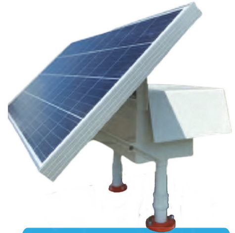
Optional Solar Power Supply