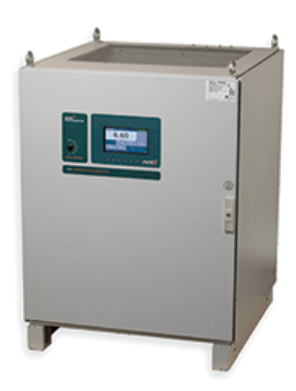
ACE3 integrated into a CCR